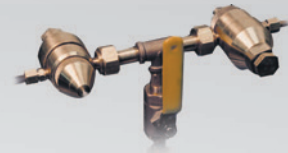
Dual Pneumatic Open Space Atomizing System

To learn more about Herrmidifier products, contact your local sales representative or visit us on the web at herrmidifier-hvac.com